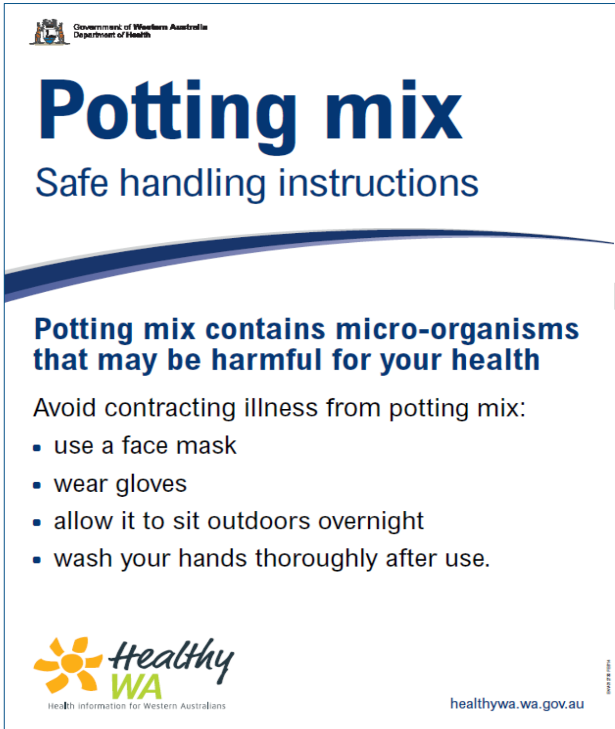
Figure 2 DOH posters advising the public on the safe handling of garden soils